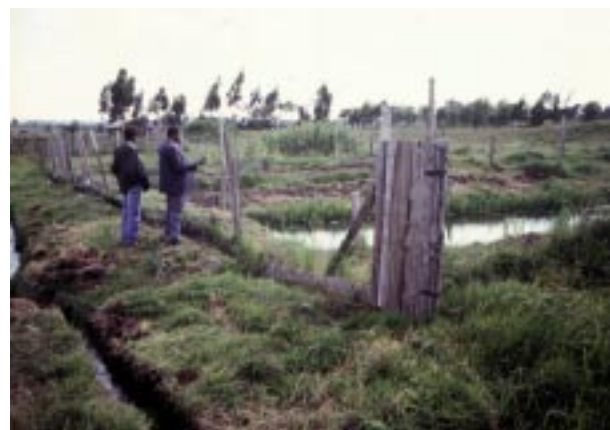
A tilapia fish pond in Nyeri district, Central Province, Kenya, in the highlands surrounding Mt. Kenya.