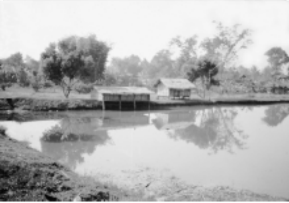
Poultry house located over a tilapia pond in Thailand. Integrated production systems are quite common in areas surrounding both the Thailand and Philippine research sites.

Filipino farmers receive some of the highest prices for tilapia of all the PD/A CRSP host countries. The CRSP study also found that a steady supply