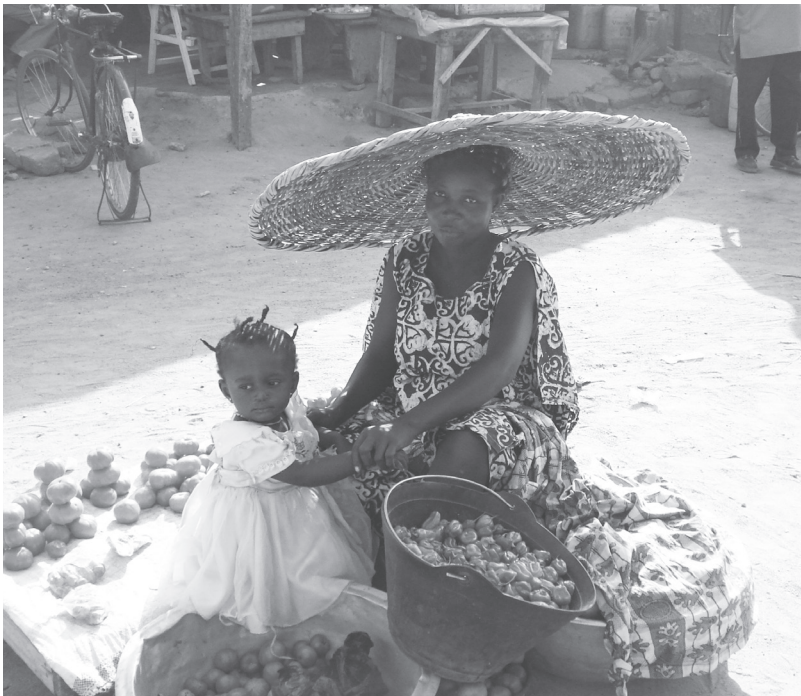
A mother looks after her daughter while selling tomatoes and hot peppers at a market in northern Ghana.