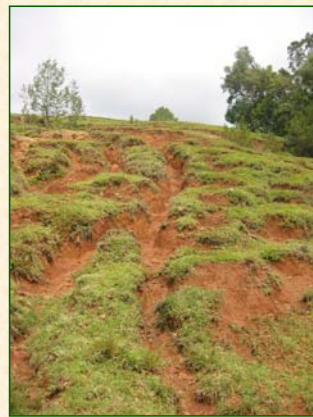
Right: Erosion resulting from slumping in heavily grazed grasslands.