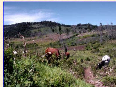
Above: Livestock grazing in plantation forest recently cleared for agriculture.