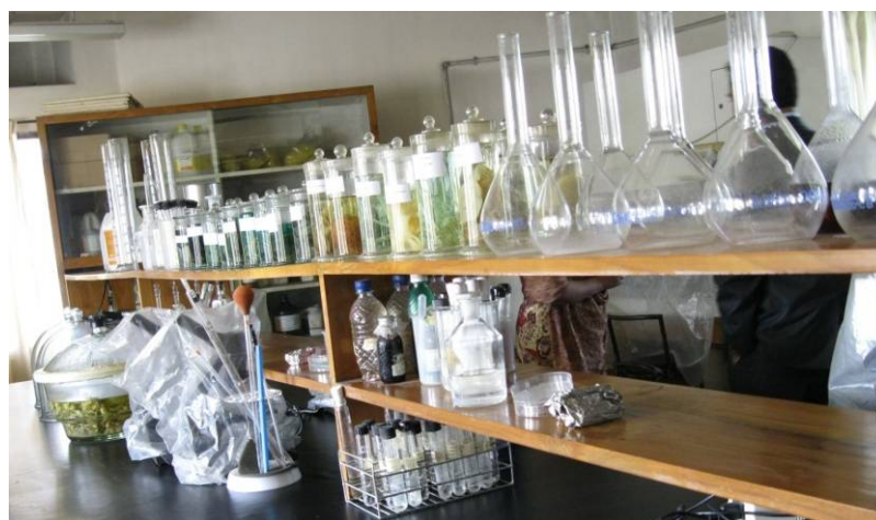
Plant Pathology Lab, HRC, BARI