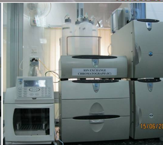
Food Safety Laboratory