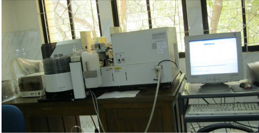
Chemistry Laboratory (used for heavy metal residue detection)