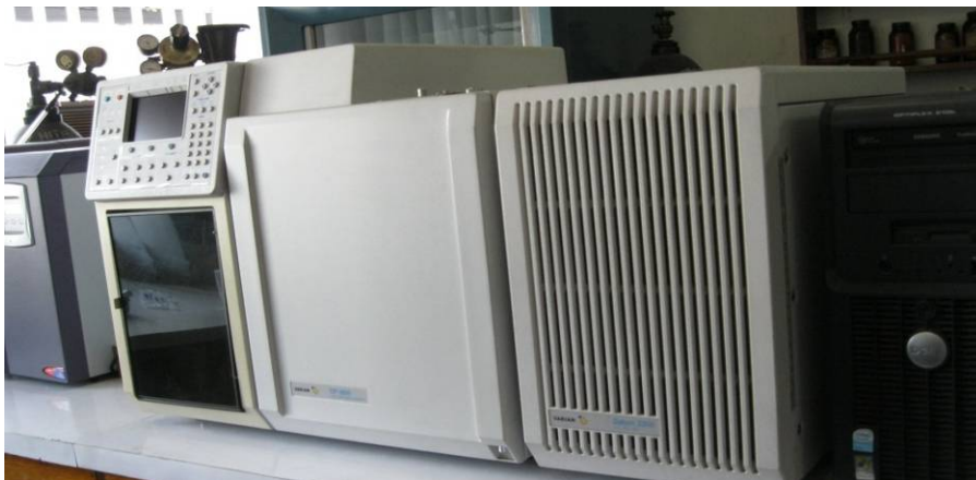
Laboratory for Electrochemical Technologies at AEC