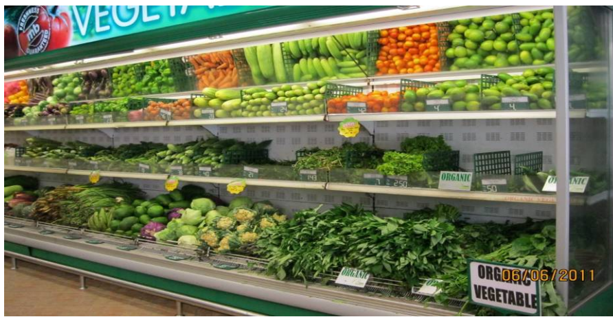
Fresh produce section of MeenaBazar with a sub section for Organic vegetables