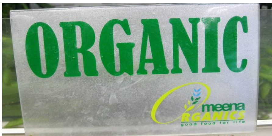
Organic logo used by Meena Bazar