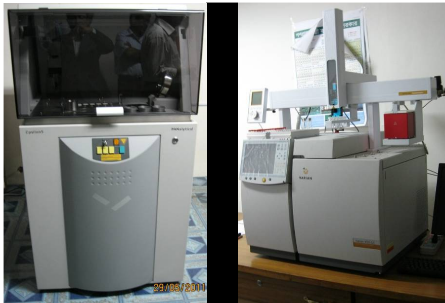
XRF Laboratory at AEC