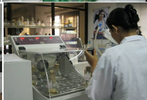
Food Toxicology Laboratory

FOOD SAFETY LABORATORY Developed Under the ADP Project - Establishment of Food Safety Laboratory for Research to Produce Safe and Quality Food to Support Food Processors (July 2009 - June 2012)