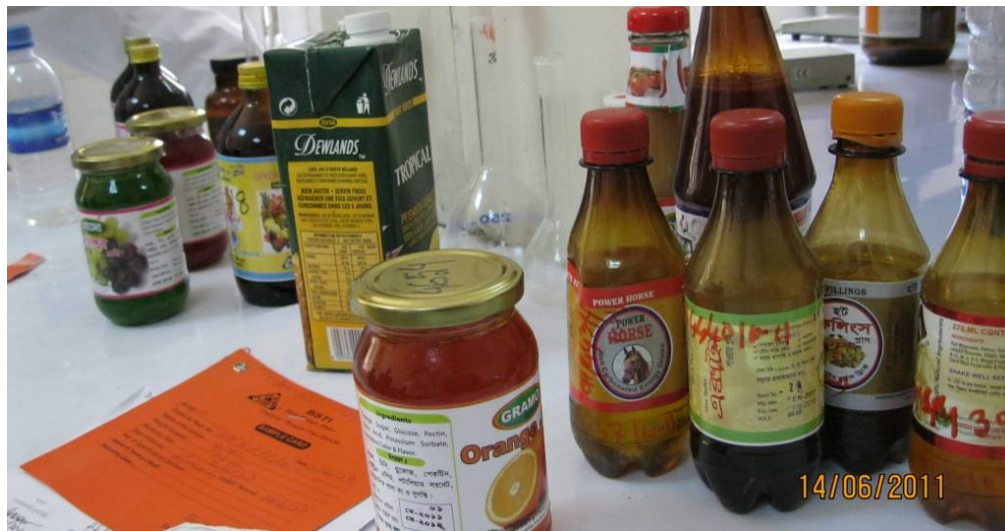
Food Testing Laboratory (Processed Fruit Products and Fruit Drinks Section)