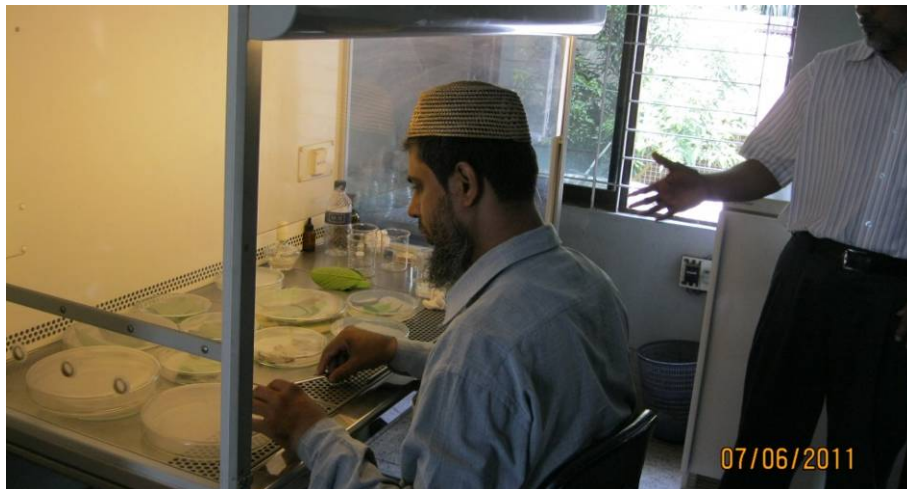
Research working in the Bacteriology Laboratory, BAU