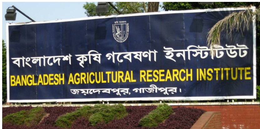
At the entrance of BARI campus in Gazipur near Dhaka