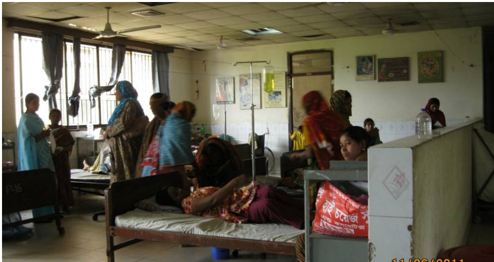
Gynecology ward at ICMH