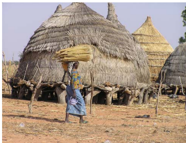
Traditional granaries in Niger

In addition to the increased yields due to the use of new technologies, the farmers following the project recommendations also received higher prices for their grain. Why were they able to obtain higher prices for