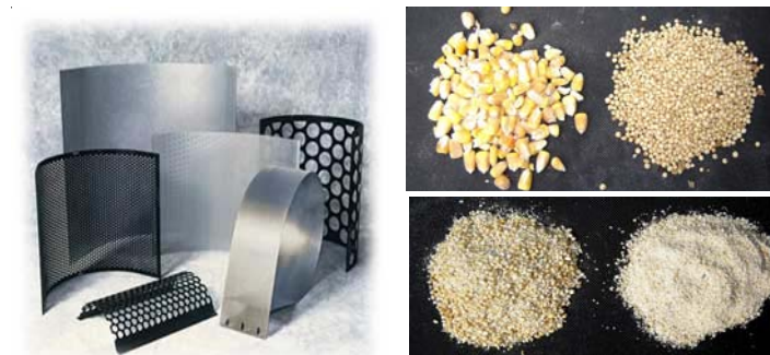
Hammermill screens for producing various grain particle sizes (upper left), whole maize and sorghum kernels (upper right) and ground sorghum (two particle sizes) (lower right).

Feed particles impact in two areas of poultry feeding. First, broilers and layers eat using their own sensory perception of the food which includes preference for certain sized particles. Second, particle size impacts directly the manner in which chickens utilize the nutrients in their diet, both in the case of laying hens and broilers. Rate of particle breakdown in the proximal small intestine is affected by grain particle size. Data from KSU suggests that particle size of the feeding ration is of major importance as regards to nutritional value to the broilers, and that the feeding value of U.S. sorghum is comparable to U.S. maize when ground to an appropriate 5 mm or less particle size.