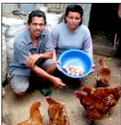
"In good hands with INTSORMIL"

Sorghum is an important crop in Nicaragua, grown largely to feed the thriving livestock industry, but it is also cultivated for food security