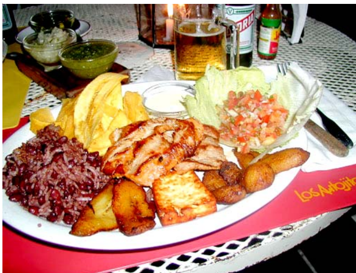
Gallo Pinto in Nicaragua

The Central American INTSORMIL project is dedicated to the promotion of sorghum as a feed for the burgeoning poultry industry. Poultry nutrition, for both broilers and egg production, is a major subject