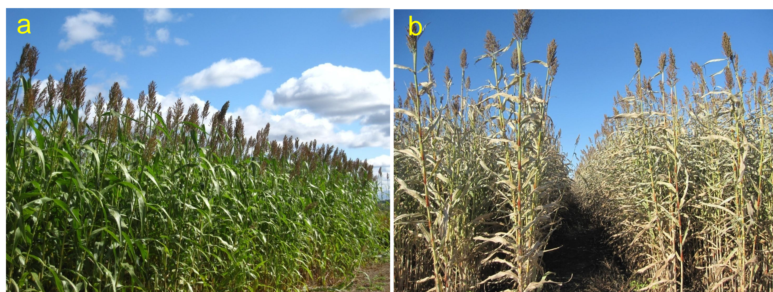
Figure 1. Photographs showing plants at (a) milky stage; and (b) hard dough stage of sweet sorghum M81E under field conditions during 2009 in Manhattan, Kansas.

All plants from center 1.5-m long row were harvested at each growth stage, and the stalks were stripped of leaves and juice was extracted using motor operated three roller sugarcane crusher. After juice extraction, the juice volume of the sample was used to calculate juice yield. Data on plant height, stem girth, brix value (Digital refractometer, Atago, Bellevue, WA), and dry weights of stem, leaves and seed were determined. Juice yield and brix values were used to calculate sugar yield. The total sugars and reducing sugars were estimated by Robertson et al. (1996) method in the juice samples and expressed as percentage. Non-reducing sugar was obtained from the differences of total and reducing sugars and expressed as percentage.