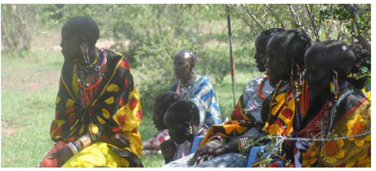
Masai women listening in a focus group.

Maasailand, the vast region of Maasai-speaking peoples in Kenya and Tanzania, is home to a variety of pastoralists and agropastoralists heavily dependent on livestock for their food security. The region also includes several of the world's signature conservation reserves, such as Maasai Mara National Reserve, Amboseli National Park and Nairobi National Park. Like other dryland regions, Maasailand is undergoing rapid changes including high population growth, early privatization of rangelands, strong in-migration of non-pastoralists, changes in weather and seasonality, and land cover and land use changes. Thus, this region represents a potential future of pastoralism elsewhere. As such, studying livestock systems and climate change here will yield particularly useful knowledge about future trajectories of intensifying and diversifying pastoral systems both here and elsewhere.