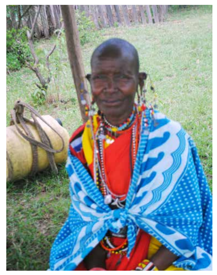
A Masai woman.

"The herders agreed unanimously that weather patterns have changed. More than half of the respondents had no idea what causes the changes in weather though many said, 'Only God knows.'"