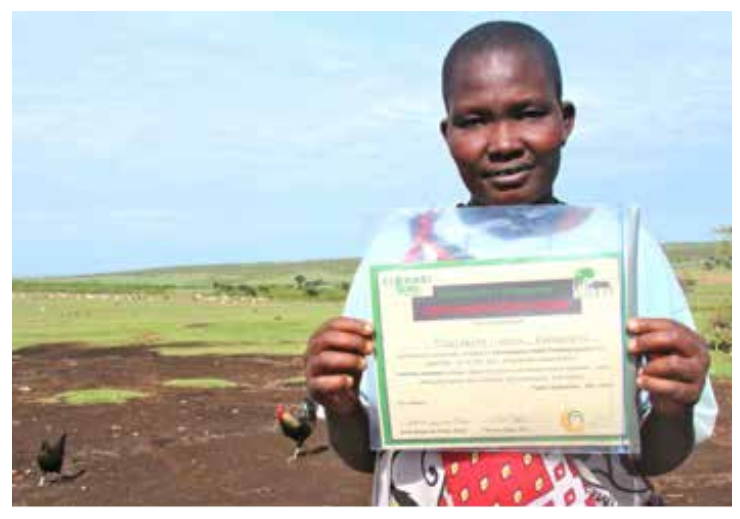
A pastoralist and her video production course certificate.

We helped our Maasai participants create a video as well as a photo essay about their participation in our study. We developed a trailer of an upcoming collaborative documentary, Our Pastoralist Voices on Climate Change, of the PTRF project and local issues related to climate change from the perspective of local pastoralists.